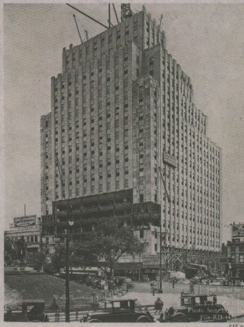
New Jersey Bell Telephone Co., Newark, N. J. Architects, Voorhees, Gmelin & Walker.

Size, 221' x 141' in plan, 20 stories with two basements.