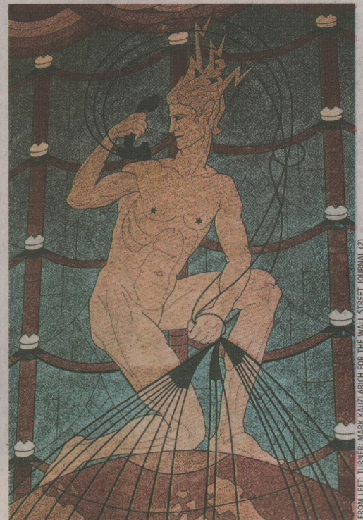
FROM LEFT: TURNER, MARK KAULZARICH FOR THE WALL STREET JOURNAL (2)

The Bell Telephone Building, top left, was constructed in the 1920s in Newark. An original art deco mural of the Roman god Mercury decorates the lobby of the building at 540 Broad St. Below, the structure is being transformed into apartments and commercial space.