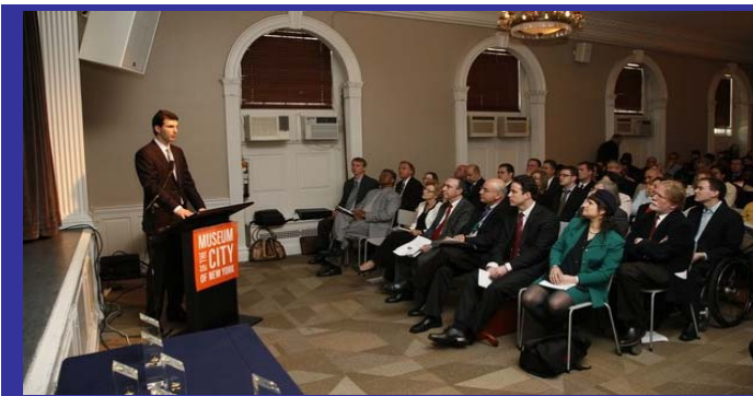
Start of the Awards Program in Auditorium of MCNY