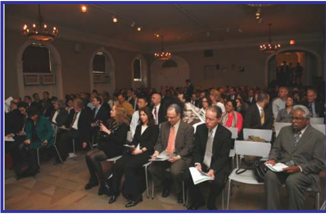
People in the auditorium during the award conferral ceremony