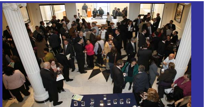
Gathering in the Rotunda of MCNY pre-program

The event was held at the Museum of the City of New York, where attendees got a chance to view "Growing and Greening New York: PlaNYC and the Future of the City." The exhibit showcased the infrastructure and environmental challenges the city faces as it prepares for its population to reach 9 million residents by 2030.