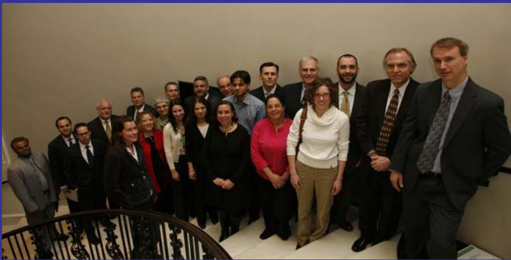
Representatives from the Partnerships founding member organizations with event speakers and the 2009 brownfield scholarship recipients.