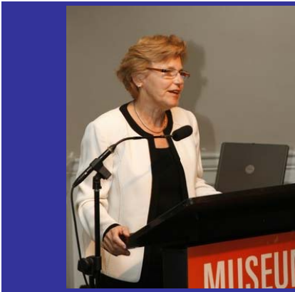
Val Washington, Deputy Commissioner for the NYS Department of Environmental Conservation