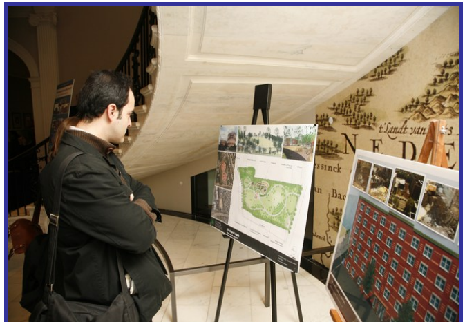
Posters of winning projects were available for viewing. Shown here are posters for Elmhurst Park in Queens and an affordable housing complex.