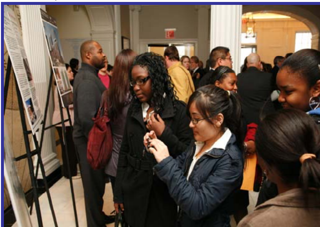
High School students from the Metropolitan Corporate Academy in Brooklyn read about the award winning projects during the morning reception.